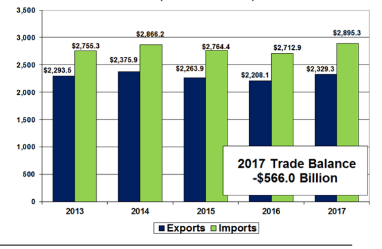
U.S. International Trade in Goods and Services (Billions of Dollars)

The 2017 figures show surpluses, in billions of dollars, with South and Central America ($34.3), Hong Kong ($32.5), Netherlands ($24.5), Belgium ($14.8), and Australia ($14.6). Deficits were recorded, in billions of dollars, with China ($375.2), European Union ($151.4), Mexico ($71.1), Japan ($68.8), Germany ($64.3), Ireland ($38.1), Italy ($31.6), Malaysia ($24.6), India ($22.9), South Korea ($22.9), Thailand ($20.4), Canada ($17.6), Taiwan ($16.7), France ($15.3), Switzerland ($14.3), Indonesia ($13.3), and OPEC ($13.0).