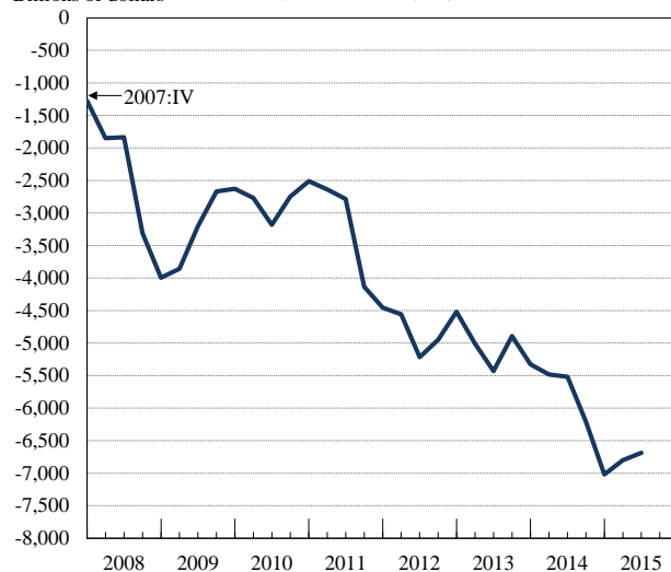
Chart 1. U.S. Net International Investment Position, 2007:IV-2015:II (Quarterly, not seasonally adjusted)