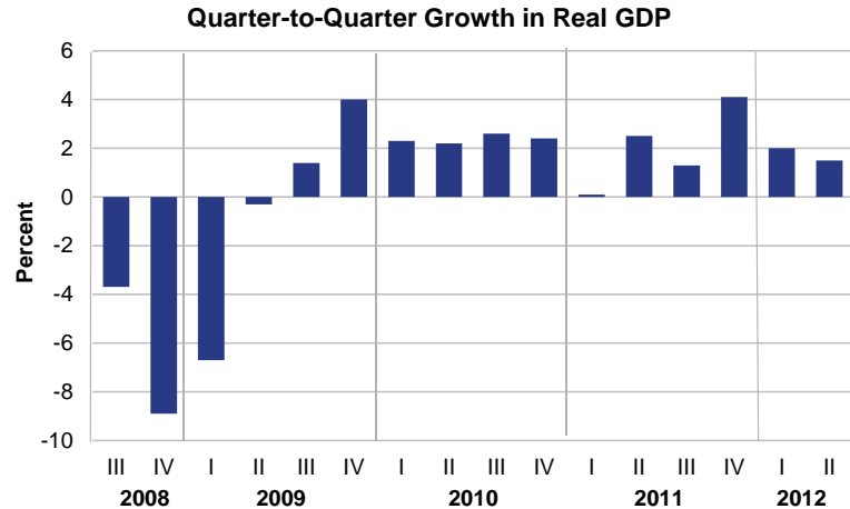
Real GDP growth is measured at seasonally adjusted annual rates.

Positive contributions to economic growth also stemmed from an upturn in inventory investment and a smaller decline in national defense spending.